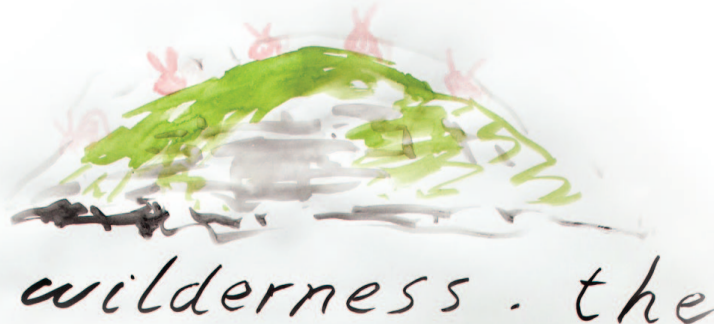
Wilderness the (2009)