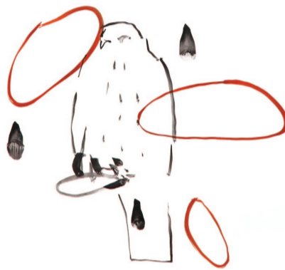
Falcon ringed (2009)

I can tell you things I can describe to no one else. I respect your opinion and I appreciate your feedback. Although our conversation will be all one-way traffic, I will talk and you will find yourself listening. A wooded landscape is interspersed with singular drawings, leaking into one another, in a Derridean diorama. Here we find a literal representation of a frame or a forest laced with potential – wood before it is moulded. The painting is the frame. The drawing does not lead to the painting. The painting exists in order to support the drawings. A disconcerting forest brooding with malcontent is rendered bluntly and directly to a gallery wall. This dense woodland is stripped bare. It is untamed but contained by a mind and painted by human hands in order to be seen. Image making plucked from the edges to be planted in someone else's peripheries. A wall is not a wall when it is a frame. Prose about de-framing interstices from the edge to the centre. There is no story but there are several beginnings.